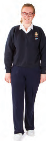
Brigader Company Uniform