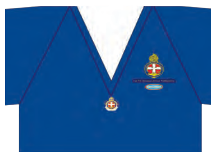
With 125th Anniversary Badge