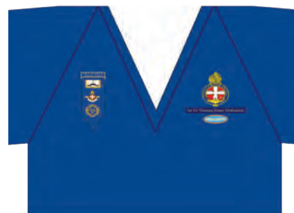
Brigader Sweatshirt with Ribbon

**Brigader Brooch may be worn here after Queen's Award is achieved.