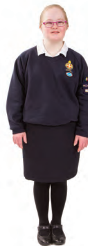
Brigader Ceremonial Uniform