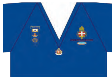
With 125th Anniversary Badge

Please note: all uniform should be worn with no jewellery and no nail polish