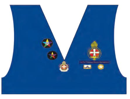
With 125th Anniversary Badge

Please note: all uniform should be worn with no jewellery and no nail polish