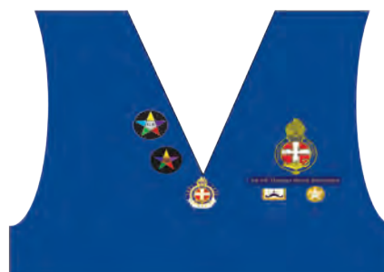
From Sept 2018, Explorer Awards

Please note: all uniform should be worn with no jewellery and no nail polish