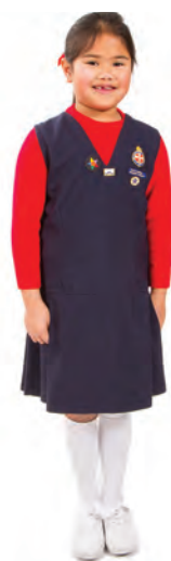
Explorer Ceremonial Uniform