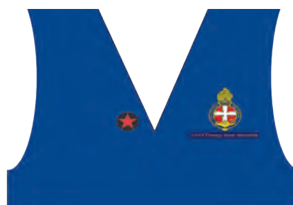
Explorer Red Star