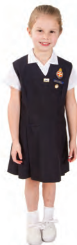
Explorer PE Uniform