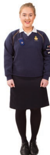
Sub-Officer Ceremonial Uniform