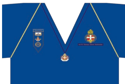
With 125th Anniversary Badge

See page 37 for general guidance for all uniform.