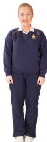
Sub-Officer Working Uniform