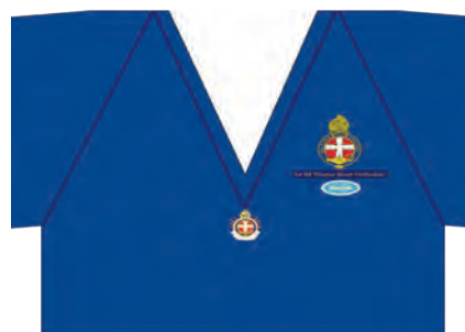
With 125th Anniversary Badge