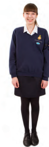
Senior Ceremonial Uniform