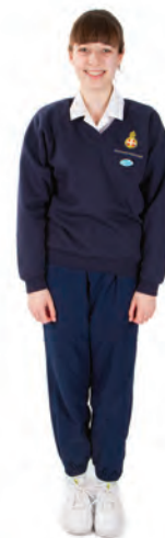
Senior Company Uniform