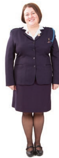
Officer Ceremonial Uniform