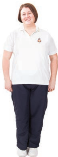
Officer Working Uniform