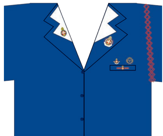
Officer Uniform with two other awards