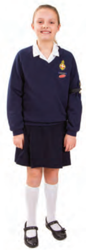
Junior Ceremonial Uniform