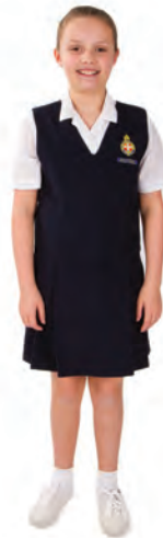
Junior Company/ PE Uniform