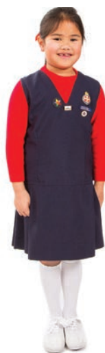
Explorer Ceremonial Uniform