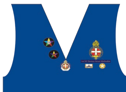
With 125th Anniversary Badge