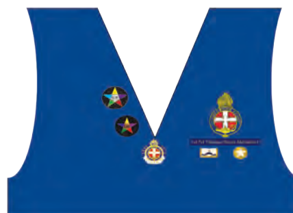
With 125th Anniversary Badge