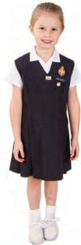
Explorer PE Uniform