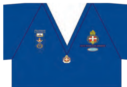
With 125th Anniversary Badge