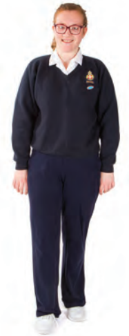
Brigader Company Uniform