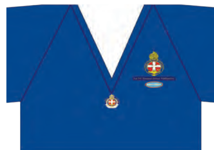
With 125th Anniversary Badge