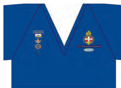
Brigader Sweatshirt with Ribbon