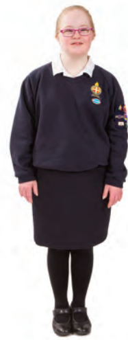
Brigader Ceremonial Uniform