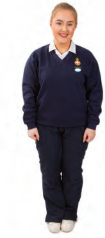
Associate Working Uniform