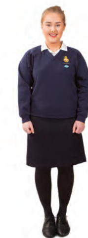
Associate Ceremonial Uniform