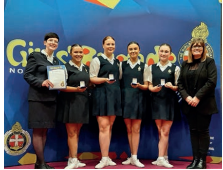
2 nd 106th NI Ballygowan Presbyterian A