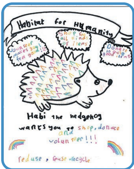
375th NI Railway Street Presbyterian - Freya Burrows