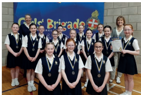
2 nd 8th NI Trinity Presbyterian Bangor