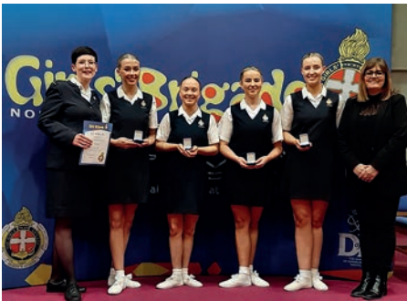
3 rd 106th NI Ballygowan Presbyterian B