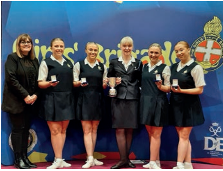
1 st 160th NI St Pauls Parish Lisburn