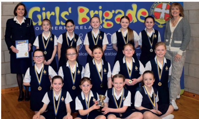
1 st 106th NI Ballygowan Presbyterian