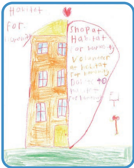
12th NI Magheragall Presbyterian - Orla Wellings