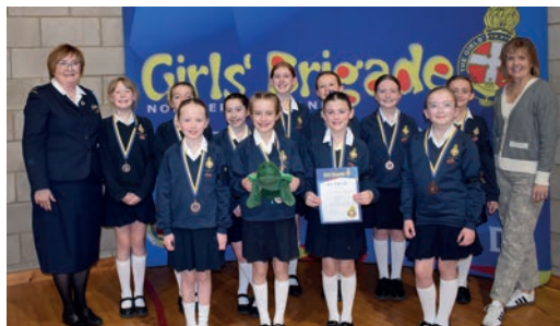
3 rd 29th NI Cregagh Congregational