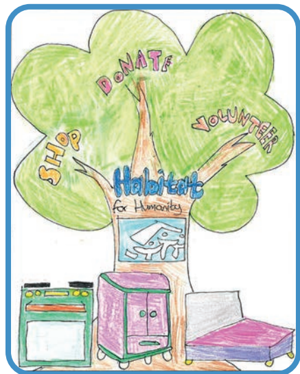
375th NI Railway Street Presbyterian - Hope Bryson